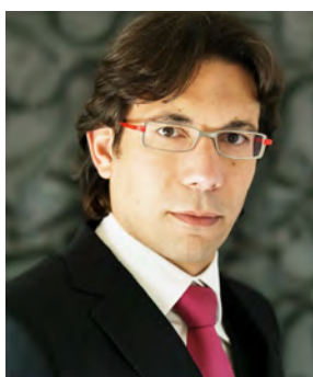
Commercial & Banking Practice Managing Partner stylianos@tcalaw.eu